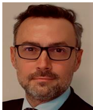
Tomás REYES ORTEGA European External Action Service (EEAS)